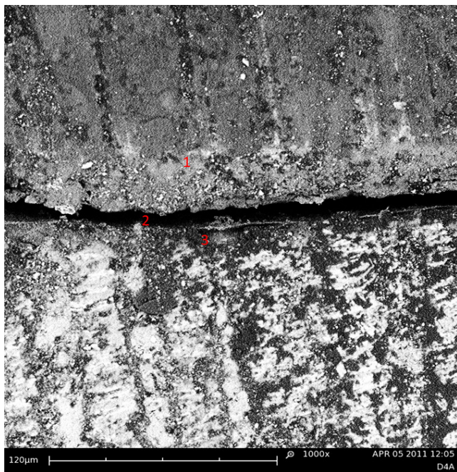
Figure 1: Sectioned tooth showing the composite (1), bonding agent space (2) and the tooth structure (3) as seen under a scanning electron microscope (SEM)

A total of 60 teeth (120 cavities) were prepared in this study with 10 teeth (20 cavities) randomly assigned to each group. Each tooth was prepared with a Class III cavity on both proximal surfaces and restored. However, a total of 5 per cent of the teeth were damaged during sectioning. Due to the limitation of time, no new samples were chosen. Out of 120 cavities, only 82 cavities were evaluated with 12 cavities in group A1 and C2, 13 cavities in group A2, 14 cavities in group B1 and C1, and 17 cavities in group B2. The SEM images of the sectioned teeth reveal the extent of dye penetration providing an understanding of microleakage and the resistance offered by the newly developed nanocomposite (Figure 1). A corresponding CLSM image showing the dye penetration has been shown in Figure 2.