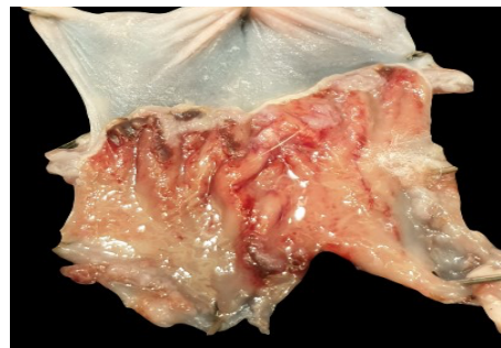
Fig.2. (a) shown the rats stomach control group, (b) rats stomach prevented with H. perforatum extract, (c) rats stomach prevented with antibacterial omeprazole.

The color of the stomach is one of the parameters that considered in the study, color of prevented rat stomach with Hypericum perforatum are significantly changed comparing with ulcer control group, white bright color was found in the stomach of the rats with Hypericum perforatum , pink to red color was found at the each of the stomach, otherwise the control groups stomach was totally dark red because of the ulcer and inflammation that caused by H. pylori , while the color of prevented rat stomach with omeprazole are changed comparing with ulcer control group, red bright color was found in the stomach of the rats with omeprazole shown in Figure 2 (13).