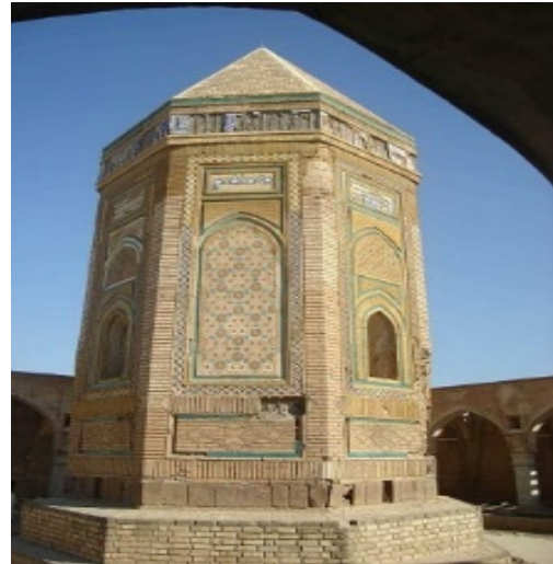
Figure 7. Heritage buildings are characterized by consistency and harmony with nature.

Urban forms are multiple and changeable according to time and place, and they are means of expression. The more these forms are able to reflect and embody the essential characteristics of the total and social values, customs, traditions and lifestyle of the community, in addition to compatibility with the surrounding environment, the more these forms are an expression of the civilized and cultural identity of the community, if The expression of identity, as Al-Naeem says, is a dynamic process that weakens and strengthens, and it may grow over time.