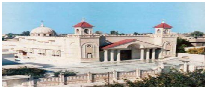
Figure 3. Cultural heritage of the city of Kirkuk

Studying for the key elements of this identity is necessary in order to determine Kirkuk's architectural identity. How might its vintage and modern urban goods represent this identity in actual reality. The city of Kirkuk is considered one of the ancient Iraqi cities that formed a link between the ancient civilizations in the East and other civilizations, as it was called by its inhabitants as. Throughout history, it remained the window of Iraq overlooking the outside, due to the important strategic location that the city enjoys and also considering it a cave, and the spread of walls, castles, forts, and a system of wells dating back more than a century indicate the presence of ancient architecture that derives its basic value from the cultural heritage of the city of Kirkuk as shown in figure 3.