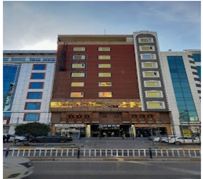
Figure 9. The relationship between building facades & sunlight and the use of reinforced concrete.

Also, many people had to block balconies and windows to ensure the privacy of the building, and to prevent the heat from entering the air-conditioning units located in the recesses between buildings, and the exposure of all building facades to sunlight and the use of reinforced concrete [13], leads to a large consumption of electrical energy as shown in figure 9.