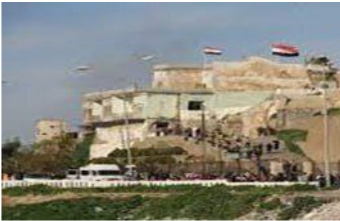
Figure 4. A radical transformation in the city of Kirkuk.

The introduction of models of modern buildings, which became an explicit and clear example of the identity crisis that most Iraqi cities suffer from, most of whose modern buildings depend on the language of And the vocabulary of Western architecture that does not reflect the culture of society, does not interact with the local environment, and has no connection with heritage constants, and this is what results in a false identity, and the features of this crisis are summarized in: