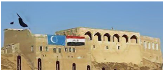
Figure 1. Kirkuk heritage

2) Temporary factors: These include social and economic conditions and the artistic and constructional heritage [5] that the architectural identity is a sign in the language of architecture linked to the place, so the characteristics of the architectural identity were associated with extension and breadth with the geographical signs associated with the formation of the identity of the place and the cultural identity of the person who lives in it. Kirkuk, this city whose identity carried a deep dimension throughout history, and basic characteristics and landmarks that reflected its civilization and its intellectual, artistic and social richness has been and is currently subject to distortion and gradual change in its architectural character as a result of the social and economic changes that the city is going through, as well as the lack of awareness of the local authority and the people of the danger This problem, which leads the city to lose its future identity and personality as shown in figure 1.