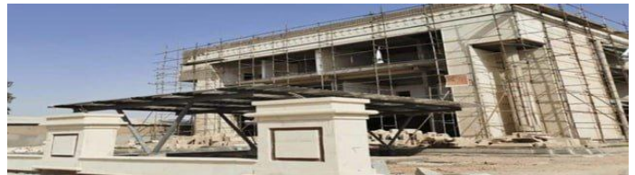
Figure 6. Glass surfaces in the city of Kirkuk.